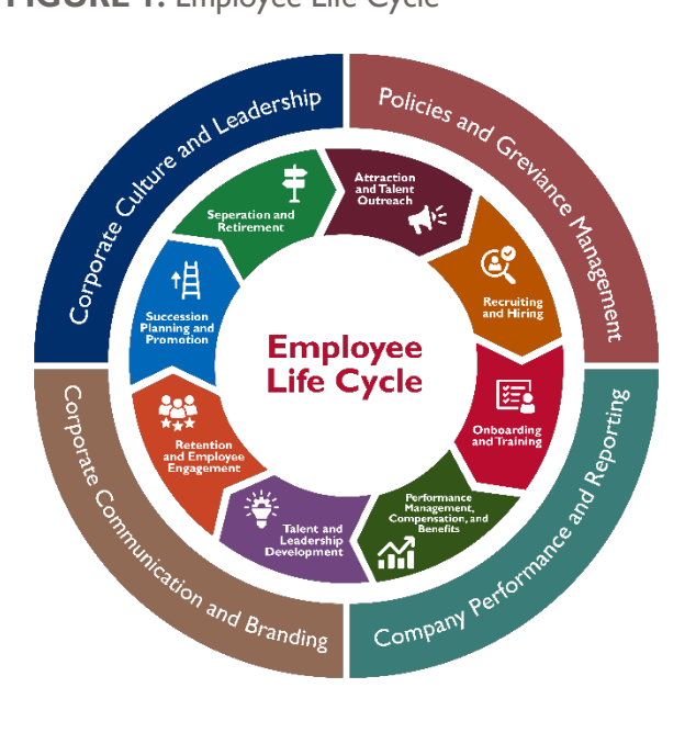
FIGURE 1: Employee Life Cycle

effecting long-lasting and impactful change within partner organizations within male-dominated industries. From attraction and talent outreach to separation and retirement, there are numerous opportunities to promote gender equality within any workplace.