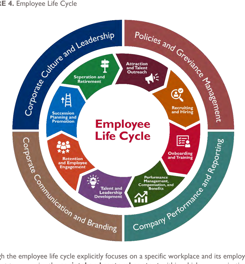
FIGURE 4. Employee Life Cycle

Although the employee life cycle explicitly focuses on a specific workplace and its employees, it is also important to recognize the societal and sectoral context within which an organization operates. This context influences norms, beliefs, and practices that pervade workplace culture and therefore is critical for workplace leaders to understand when implementing best practices. This context consists of the national legal and policy framework, regional gender norms and values, the economic environment and attractiveness of the market, the quality of the education system, services, and infrastructure to enable workforce participation, as well as monitoring and regulatory organizations. Additionally, workplaces may also influence the societal and sectoral context. Therefore, although this framework focuses on the employee life cycle and organizational enablers and does not explicitly address this broader context, organizations are encouraged to understand the societal and sectoral context when implementing best practices.