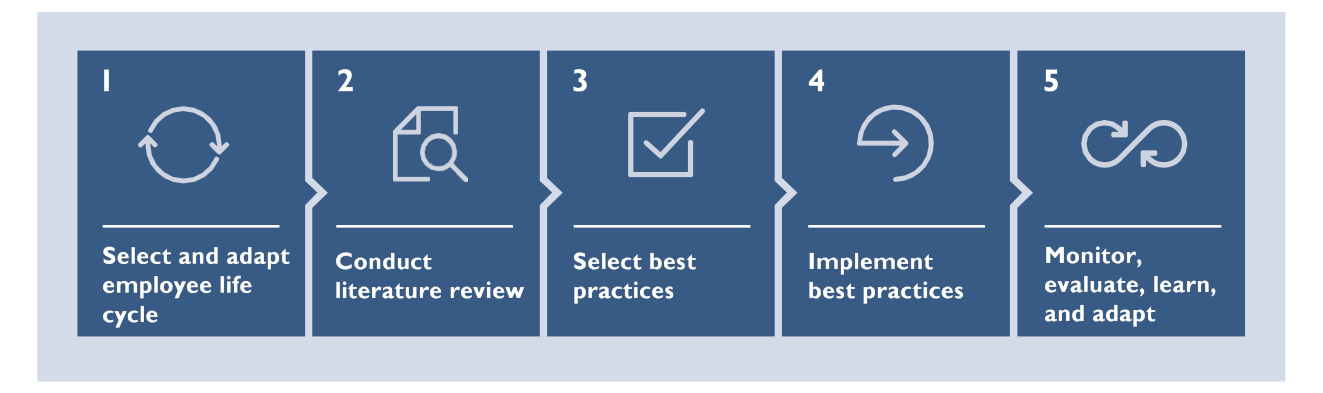
FIGURE 3. Methodology for the Development of the Best Practices Framework

The methodology to develop this framework (as depicted in Figure 3 below) included the identification and adaptation of the employee life cycle, a literature review, the selection of best practices and tools, and the implementation of a selection of those best practices with Engendering Industries partners.