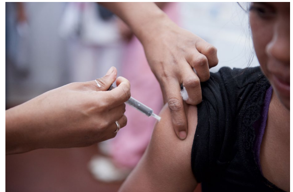
A client receives a contraceptive injection in Madagascar.

“The number of family planning users in our community keeps growing thanks to word of mouth. People particularly like talking about the positive impacts of FP on their financial life, which helps convince new users.”